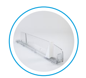
MPTN - Pusher tray narrow widths 40–57,5 mm